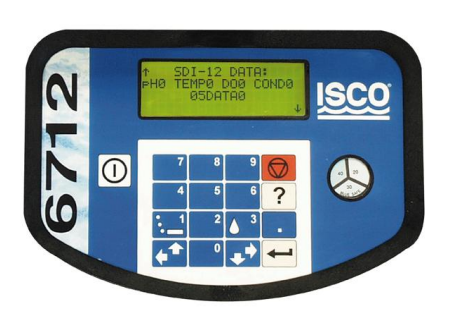
The 6712 Controller is also an SDI-12 data logger, and has many optional capabilities. Please contact Isco or your Isco distributor for more information.

E-Mail: iscoinfo@teledyne.com Internet: www.teledyneisco.com