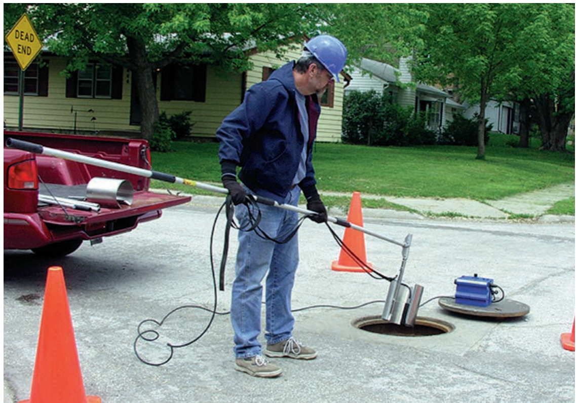
The Isco Street Level Installation Tool saves time and eliminates the hazards of manhole entry.

Easy to Remove – Pull on the strap to collapse the mounting ring for quick removal.